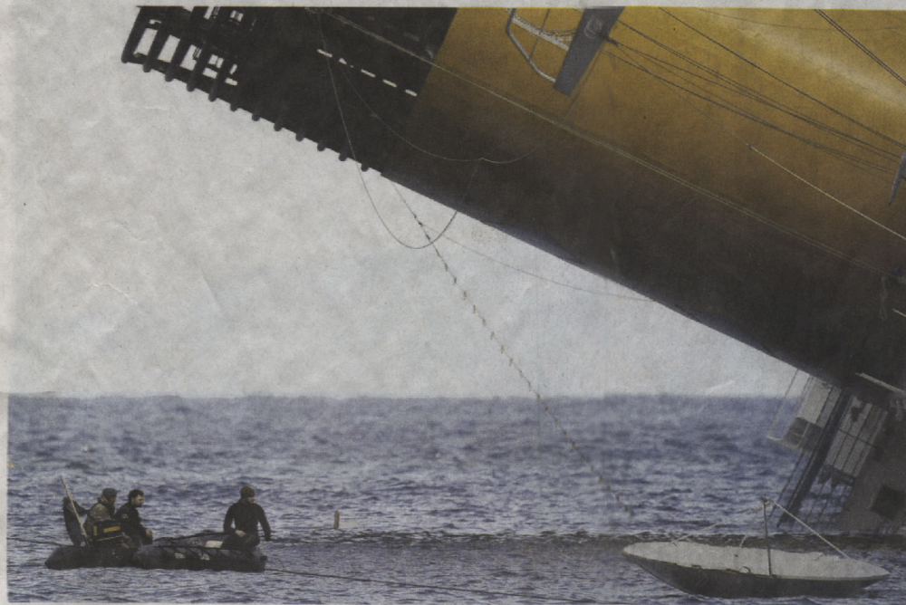
Rescuers approaching the Costa Concordia on Sunday near the Italian island of Giglio. Witnesses' accounts raised questions about whether the ship had steered sharply off course. (ILLUSTRATION BY MONTEFORTE/AGENCE FRANCE PRESSE)